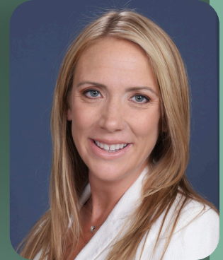
Tara Loew Apprenticeship & Training Office